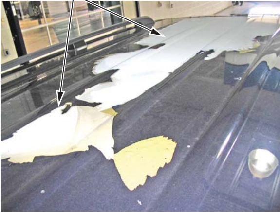
Example of paint peeling off in sheets from the roof.