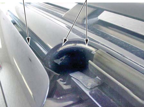
Example of paint flaking off of the roof, under the top edge of the sliding door.