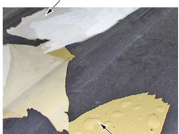
PAINT PEELED DOWN TO ED PRIMER

Wherever ED primer is exposed, you must sand down to base metal to get proper paint adhesion.