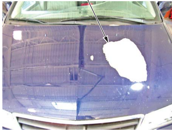
Example of paint peeling off the hood.