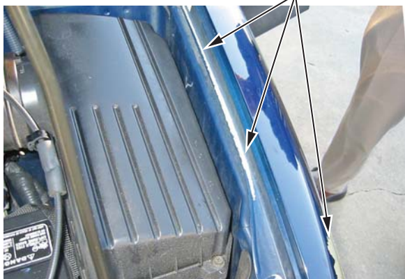
Example of paint peeling off the top of the left fender.

If you find paint peeling or flaking in any of the above areas, go to REPAIR PROCEDURE.